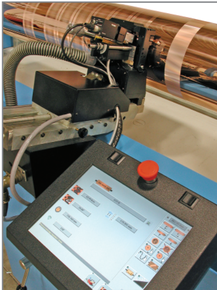
The Gravostar 857 Touchscreen Display (above) and Operator Interface (right).

The Gravostar 857 from Ohio Gravure Technologies brings low cost to advanced engraving technology. It is a perfect solution for companies with smaller budgets. Not only does the GS 857 bring new technology and improved engraving quality, the GS 857 system includes a Linux RTI engrave controller to offer a total engraving package.