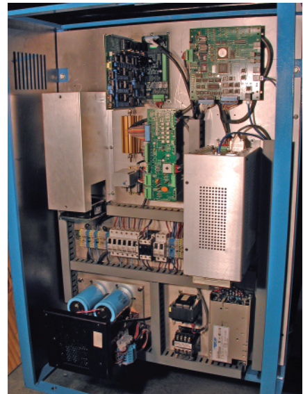
All electronics mount on-board the GS857 engraver.

For more information about the Gravostar 857, visit our website at: www.OhioGT.com